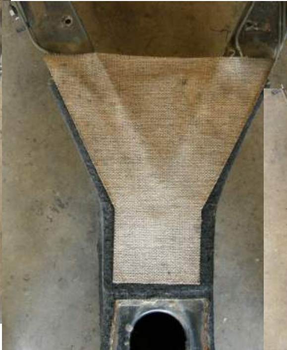
Cloth backed rubber 'Y' piece, 0.125 thick