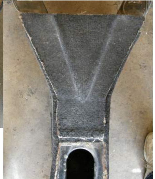
Top 'Y' piece, two pieces of jute bonded 0.25" + 0.50" thick