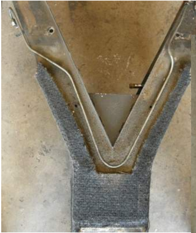
Chassis section of jute