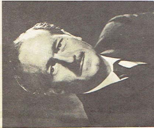
Colin Chapman, B.Sc., F.R.S.A. CHAIRMAN OF GROUP LOTUS